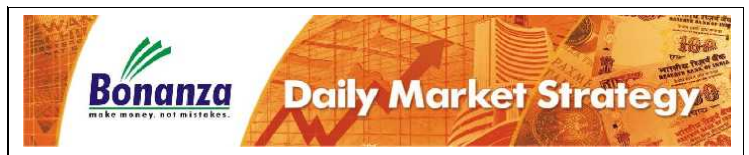
22<sup>nd</sup> July, 2022